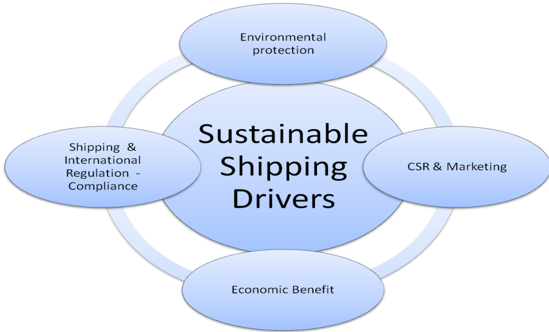
Figure One: Sustainable Shipping Drivers