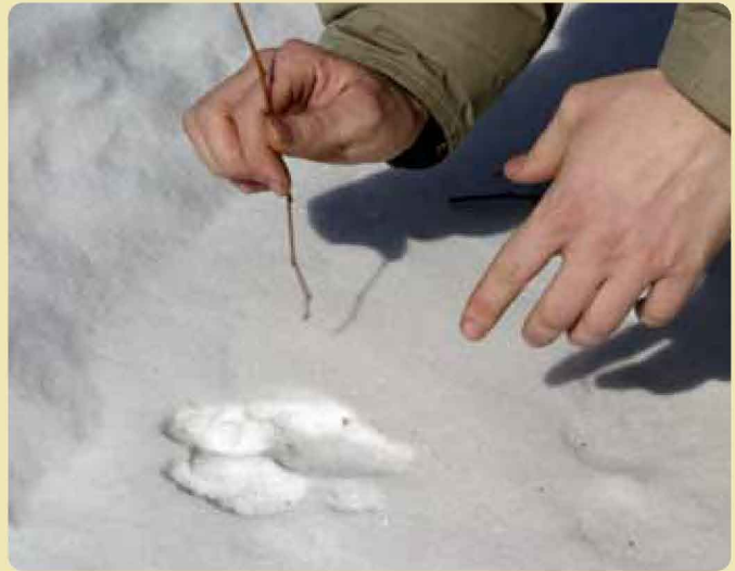
Measuring the foot print of a tiger paw in the snow.