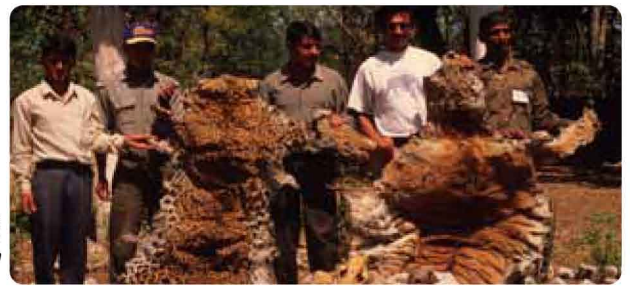
Confiscated tiger and leopard skins, Royal Chitwan National Park, Nepal.