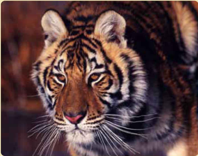
Amur or Siberian tiger.

In order to raise public awareness on the importance of a healthy Amur tiger population and educate hunters on how to hunt responsibly and on how to behave if they encounter tigers in the wild, WWF co-organizes a "Tiger Day" holiday that is held annually in Vladivostok and in villages all across Primorskii Province.