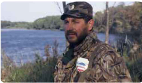
WWF Tiger anti-poaching brigade, Amur region, Russian Federation.