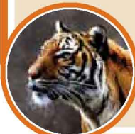
Indochinese tiger.