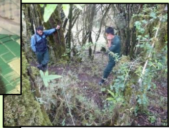
The incidence scene

Though this incidence is a sole case of a reported human slaughter in the area, locals from the village seemed to have encountered Tiger attacking their cattle since early 2010. Also, fear has engulfed the village and neighboring ones as word is around that a female Tigress with her three cubs are still residing in the nearby forests.