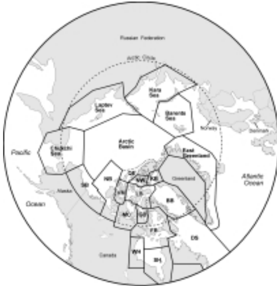
Figure 1: Circumpolar distribution of polar bear populations.

Polar bears are distributed throughout the circumpolar arctic in 20 relatively distinct populations that vary in size from a few hundred to a few thousand individuals (Figure 1, Table 1). There are estimated to be at least 22,000 polar bears worldwide, with about 60 per cent occurring in Canada.