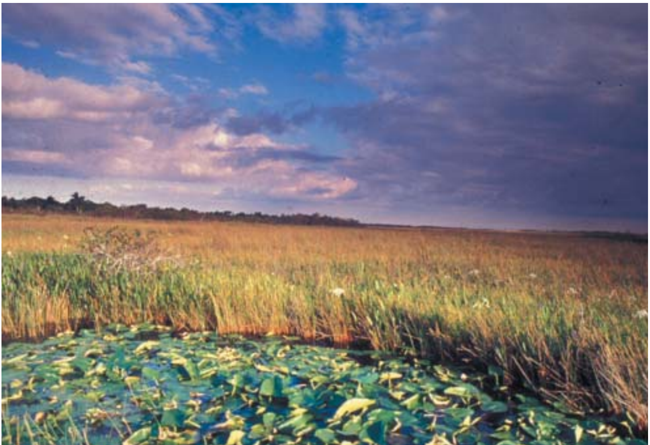
Sawgrass marsh in the Everglades. Galen Rowell

WWF was a leader in the environmental community during the development of the CERP and advocated strongly with its partners for the timely delivery of an adequate conceptual plan to the US Congress in 1999.