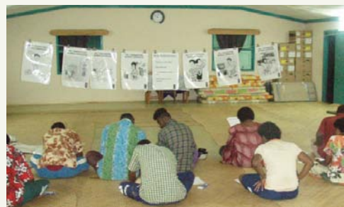
Financial literacy training with Malomalo community