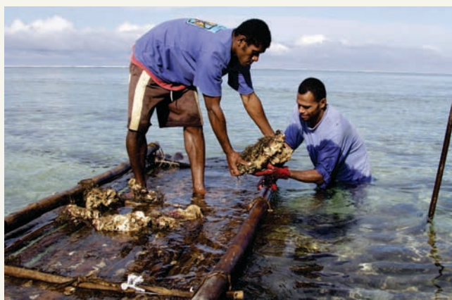
Villagers collecting live rock, Coral Coast, Fiji

Some of the focal alternative income activities have been to synergise the village potential to the local tourism industry, through handicraft production and local crop supply to resorts through community model farm development. Effort has also been made to build on community conservation efforts such as the introduction of native trees to the landscape and income potential through sandalwood introduction. Feasibility work to develop small scale eco-tourism for the village has been done to effectively link conservation and alternative income activities undertaken by the community.