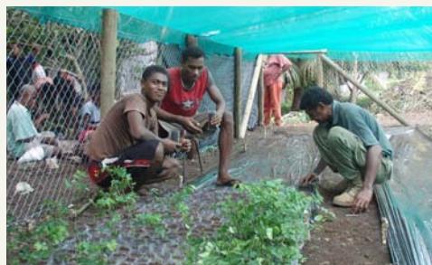
Malomalo community setting their native tree forest nursery