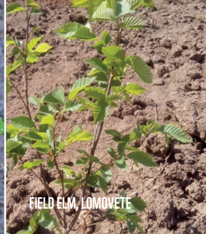
FIELD ELM, LOMOVETE