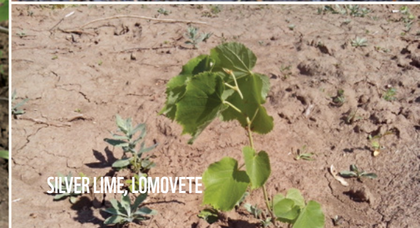
SILVER LIME, LOMOVETE