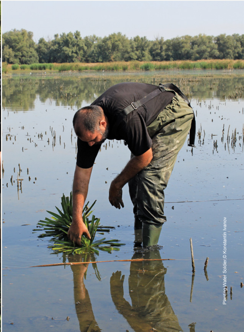
Planting Water Soldier