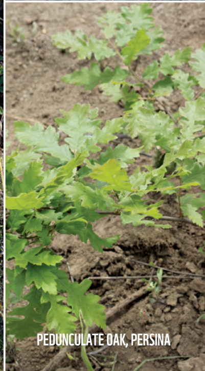
PEDUNCULATE OAK, PERSINA