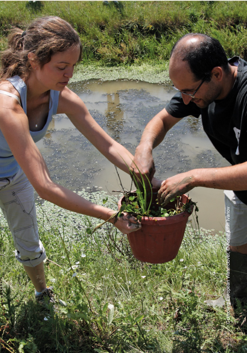
Collecting European Watercress, © Konstantin Ivanov