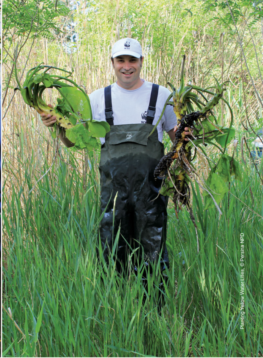
Planting Yellow Water Lilies