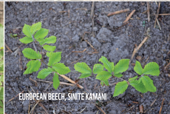
EUROPEAN BEECH, SINITE KAMANI