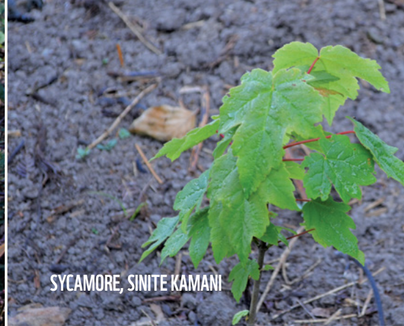
SYCAMORE, SINITE KAMANI