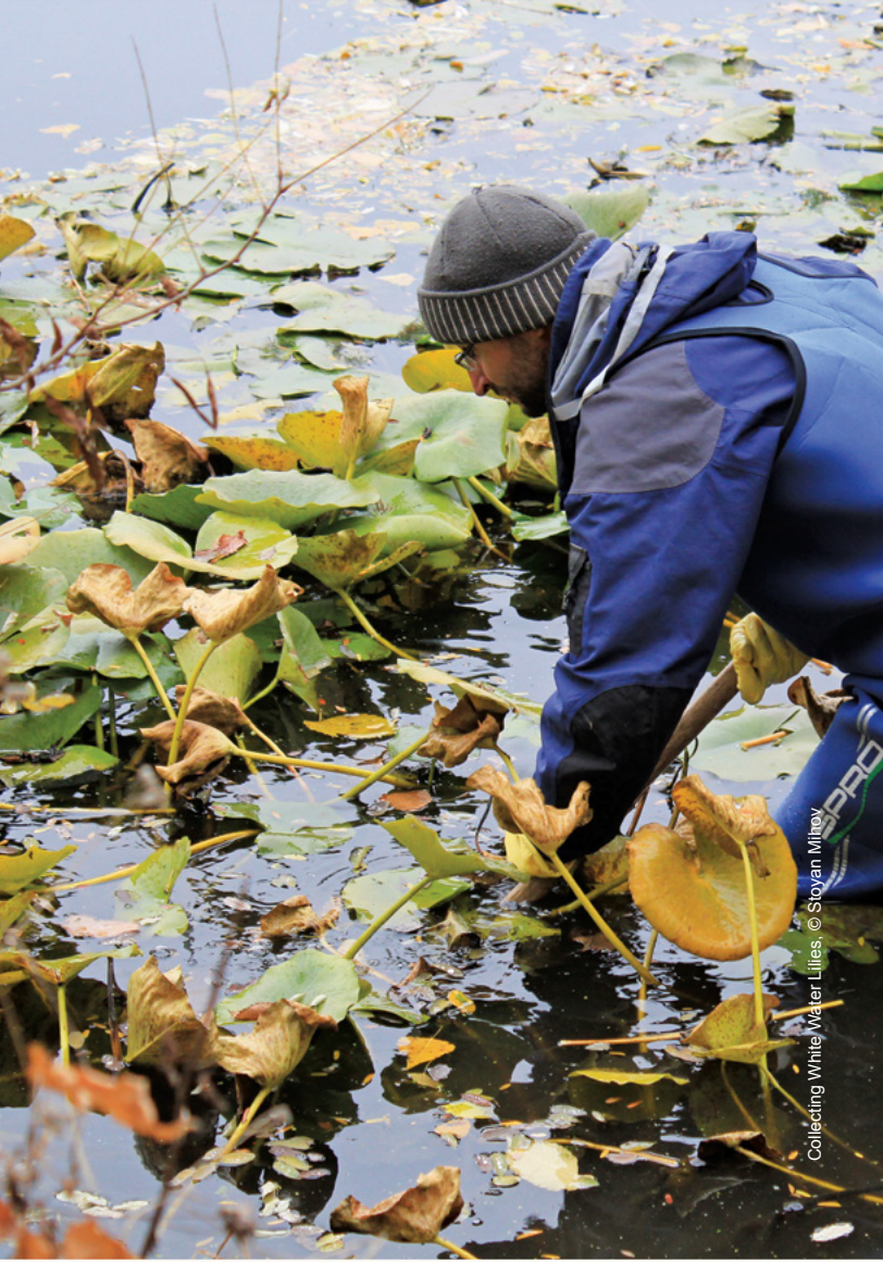
Collecting White Water Lilies, © Svojan Mitrov