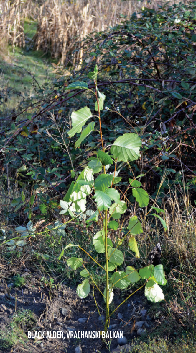
BLACK ALDER, VRACHANSKI BALKAN