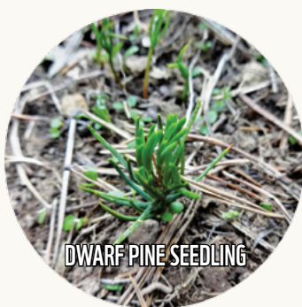
DWARF PINE SEEDLING

The Dwarf Mountain Pine slows down the snow melting thus regulating water retention and protecting slopes from erosion. In the past, the mountain was covered with vast areas of dwarf pine, but they were regularly