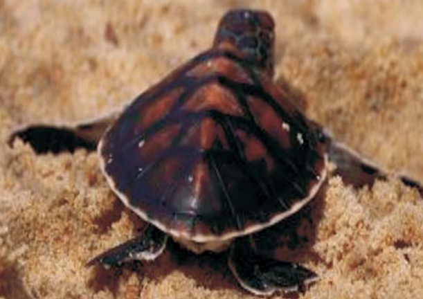
The Krabi seas have particularly high biodiversity, including globally endangered sea turtles

Fisheries. A longer dry season means additional days of fishing and increased pressure on available stocks of fish and shellfish. An agreement by all concerned parties on an equitable, enforceable, and scientifically-based regulatory system to ensure that coastal marine resources are not depleted by either commercial or subsistence fishing must be developed.