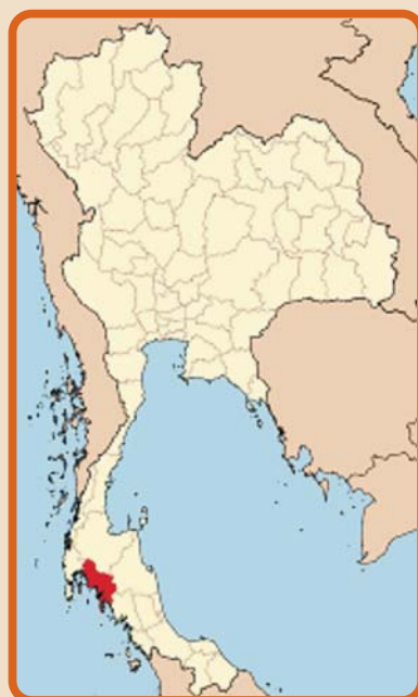
Krabi Province, Thailand

Krabi covers 4,710km 2 ; in 2007 its population was 411,000. Per capita income was $2,800 in 2006. However, not all residents have shared in the agriculture and tourism boom. Inhabitants of small coastal communities continue to depend on harvesting fish and shellfish from Krabi's coastal waters. Some have added family-scale aquaculture as a source of income.