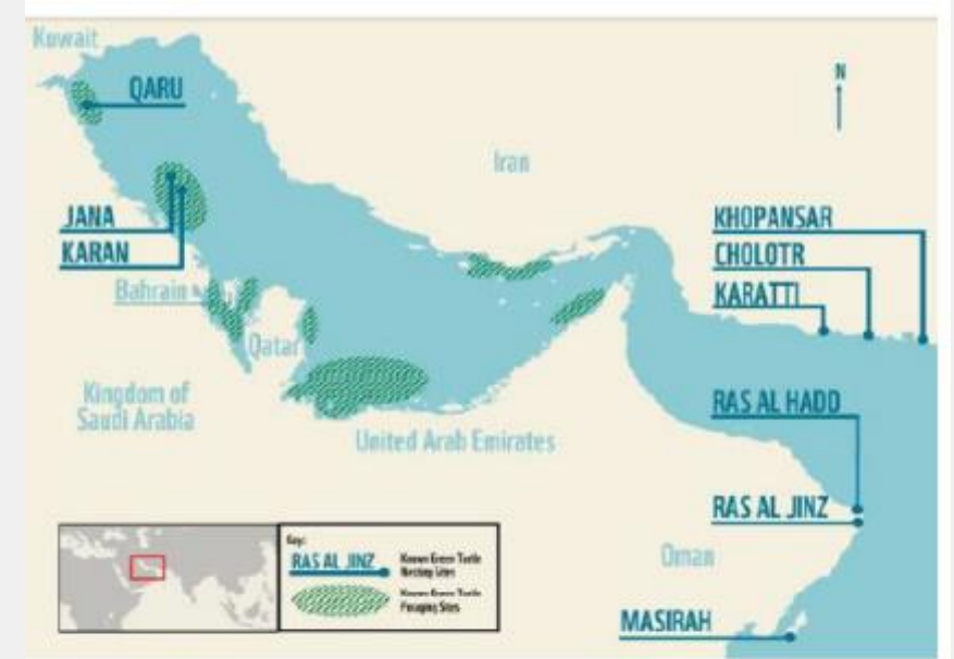
Figure 1: Map showing the known nesting and foraging sites for turtles in the Gulf region.

By working with key partners, we aim to inspire new approaches ensuring marine conservation is central to development in the UAE and wider region