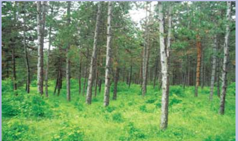
View of Khashuri Pilot Forest Site, Georgia, Jun-2011