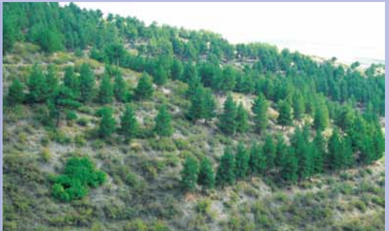
View of Aghsu Pilot Forest Site, Azerbaijan, Sep-2011