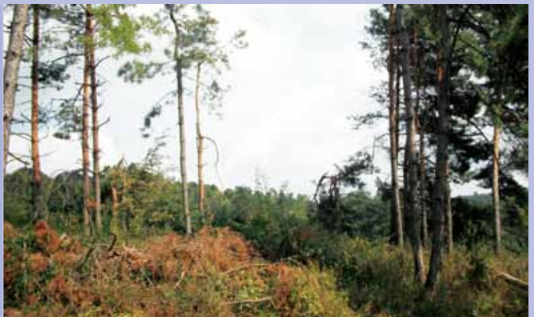
View of Koghb Pilot Forest Site, Armenia, Sep-2011