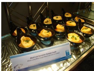
Mud Crab Ravioli in Tomato Coulis (made using wild caught Mud Crab Scylla serrata from Sri Lanka)

Singapore is one of the biggest seafood consumers in the Asia-Pacific region (100,000 tons/year on average), with almost all seafood imported from the Coral Triangle, the world's most diverse marine environment.