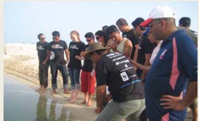
HSBC Bank Middle East employees at one of EWS-WWF's outreach activities.