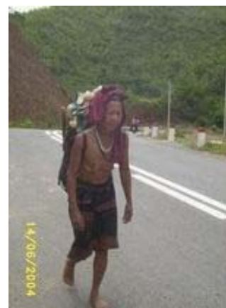
Carrying cassava home

The A'Vuong watershed also offers fertile land for crop cultivation. Most foods used in families are agricultural products. Not any household plants crop on their land. Agricultural products are quite diversified, and include mainly cassava, mountain rice, water rice, corn, sugarcane, and loofah ( Luffa acutangula L. (see Annex V). However, as was the case with NTFPs and aquatic products, many agricultural products are used for household consumption only (subsistence) and therefore in many cases market prices are not available. The agricultural products in this study include only the most common products for which market prices do exist - there are still many other products we do not value. Hence, the economic value of agriculture is under-estimated.