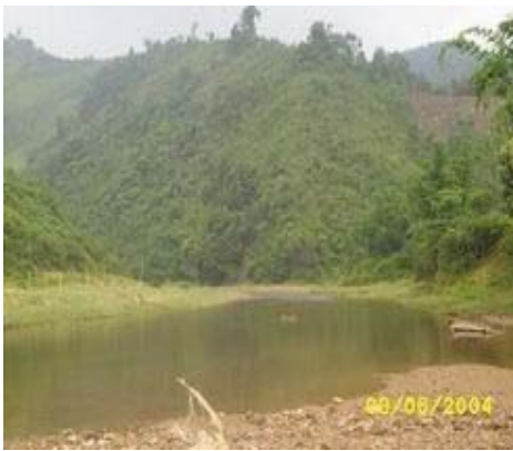
A Vuong river in Ta Lang Commune after building the Ho Chi Minh High way

At the same time, the mountainous region of Quang Nam province in which the A'Vuong is located, is rated as one of the poorest in Vietnam. The Committee for Ethnic Minorities and Mountainous Areas (CEMMA) has ranked 60 communes in the six mountain districts as highest priority for poverty alleviation and development assistance, out of a total of 63 communes in the region. The population of these six districts is 87% ethnic minority, from 12 different ethnic groups. In the upper A'Vuong area, transport, market access, education, basic infrastructure, health care and social services are all minimal, whilst the effects of war are still present. 'Agent Orange' defoliant, carpet-bombing, unexploded ordinance, and massive social upheaval have ongoing repercussions on the stability and development of communities and local institutions in the area, 30 years after the conflict ended.