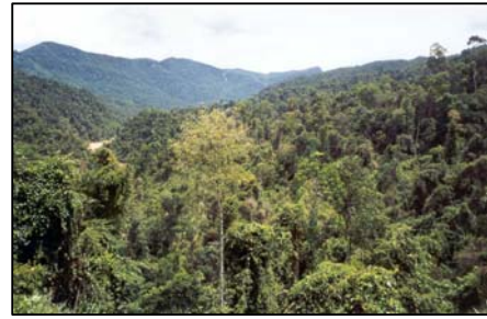
Dense forest in the A'Vuong watershed

conditions in the Truong Son mountains allowed rainforest to persist, giving its fauna and flora thousands of additional years to evolve. These conditions persist today due to the short dry season, created by the high ridge holding the easterly monsoons over the mountains, while areas surrounding the landscape suffer major climactic changes.