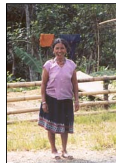
Ka Tu Woman

The upper A’Vuong watershed covers four communes (administrative units containing between 5 and 15 hamlets), namely A’Vuong; Bhalee; A’Nong; and A’Tieng. These communes are located in Tay Giang district. The indigenous population is Ka Tu, one of Vietnam’s 54 ethnic groups who traditionally live in the upper reaches of the Truong Son mountains and the Hai Van ridge, in Central Vietnam and Laos. In total, there are roughly 45,000 Ka Tu people in Vietnam. The four communes of the A’Vuong contain a total of 25 hamlets. Table 1 further illustrates the demographic situation in A’Vuong.