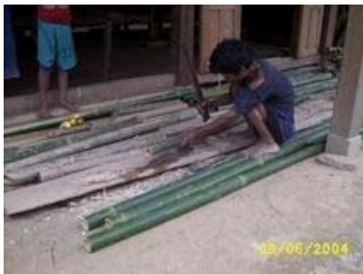
Flattening neohouzeaua for building a house

Fiber plants harvested by local people include neohouzeaua, bamboo and rattan. Neohouzeaua harvested by 259 households (equally 89% of total people) and is used for construction in poorer households - often by the children that have just separated from their parents - and for making fences. Rattan is also harvested from the forest by 68 households (about 68% of total people) and is used for selling, making baskets and fastening frames of houses. Rattan is one of the main income sources for households. However, it also depends on the number of labourers in a family: the more labour, the higher harvested quantity of rattan. Harvesting fiber plants is considered as hard work and done by men in the family. Only in some poorer households, with a lack of labour, the women are involved in these activities.