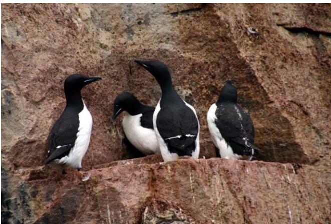
Common guillemots ( Uria aalge ) on Bird Mountain in Svalbard, Norway.

It is difficult to predict what will happen to birds. The main reason for this is that few birds stay in the Arctic for longer than three months per year. Their living conditions depend on what happens elsewhere. However, it is likely that the climatic changes underway in the Arctic will not exceed the adjustment capacity of the birds that nest there. Earlier snow-melting and increased summer temperatures will be beneficial for successful nesting.