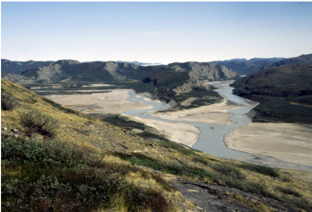
Arctic landscape and glacier rivers

The dominant plant species that constitute arctic vegetation are very different from most other types of vegetation (apart from alpine vegetation) because these species are able to carry out their metabolic and reproductive processes just above or below 0°C. Permafrost levels in the Arctic have existed for thousands of years, covered by just a thin, active layer of soil that thaws every summer. Access to nutrients is limited due to the low temperatures and the thin layer of soil. Arctic plant species have adapted their access to nutrients and their growth to this thin but relatively constant soil. Climate change can alter several of the environmental factors to which arctic plant species have become adapted. An extended growth season, earlier snow-melting, altered precipitation patterns, deeper layers of soil and increased mineralisation and decomposition rates will all affect the productivity responses and phenological development of these plants.