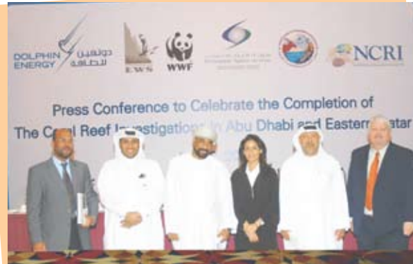
Coral Reef Press Conference in Abu Dhabi

EWS-WWF would like to express gratitude to our partners, supporters and friends who have contributed funds, time, ideas and energy to help us make our conservation work possible and shared our passionate commitment to saving nature.