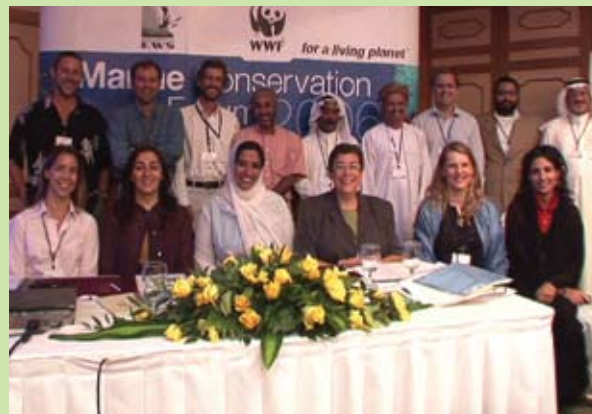
September 10, 2006 Abu Dhabi Press conference to herald Marine Conservation Forum launch