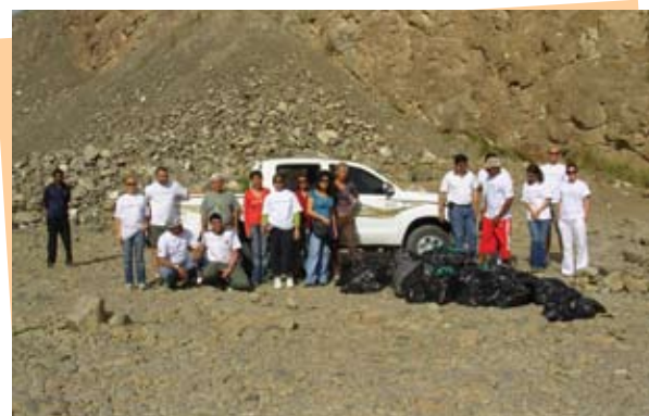
HSBC Volunteers helping cleaning up Wadi Wurayah