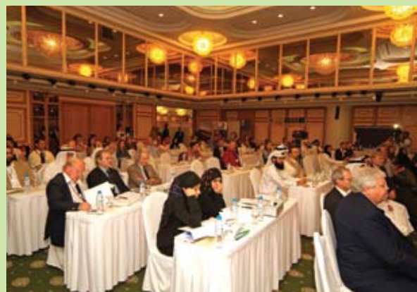
July 2007 Proceedings distributed to Forum participants and attendee governments