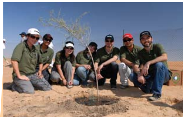
The Canon ME environmental team lending a hand planting Ghaf trees