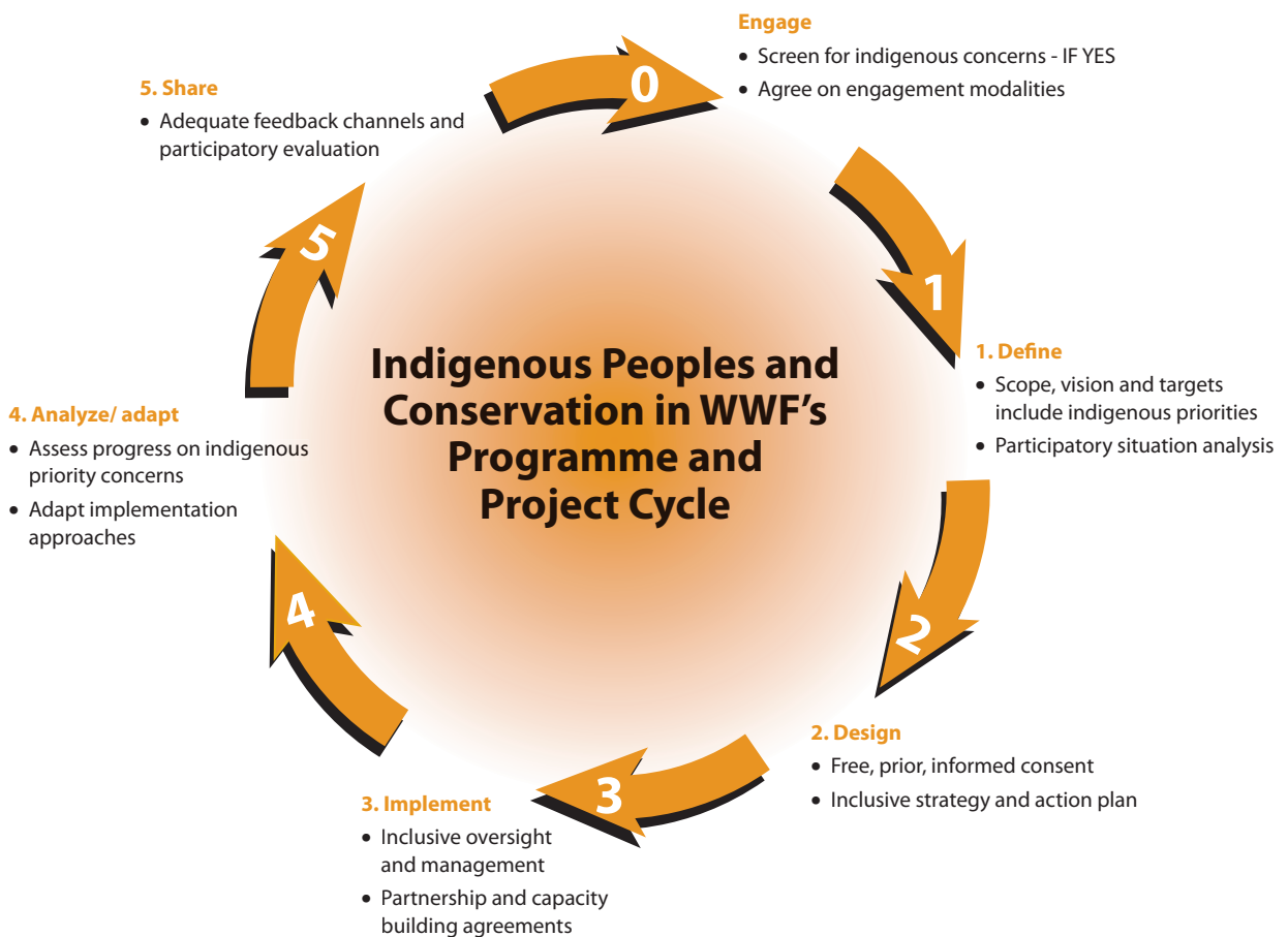
Figure 1. Indigenous Peoples and Conservation in WWF's Programme and Project Cycle: Steps and benchmarks

The following sections outline practical guidelines for mainstreaming implementation of WWF's Statement of Principles on Indigenous Peoples and Conservation in programme and project management. Each section describes recommended activities linked to steps of the WWF Standards framework, and key benchmarks of policy implementation. Core requirements of WWF's Statement of Principles are presented in shaded boxes at relevant points. Often, there are several points in the planning cycle at which policy requirements can be met. In keeping with best practice, these guidelines recommend addressing them at the earliest possible point.